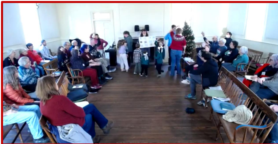
First Day School leading a rousing version of The Twelve Days of Christmas at our annual Christmas Program.