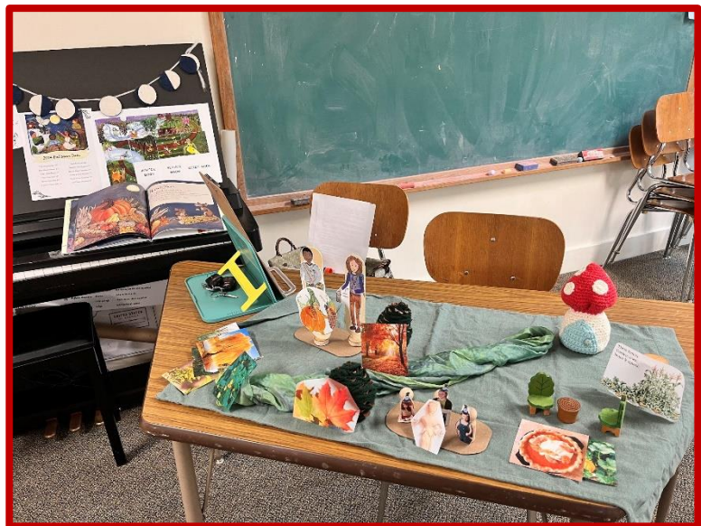
Celebrating the Full Wolf Moon in First Day School.