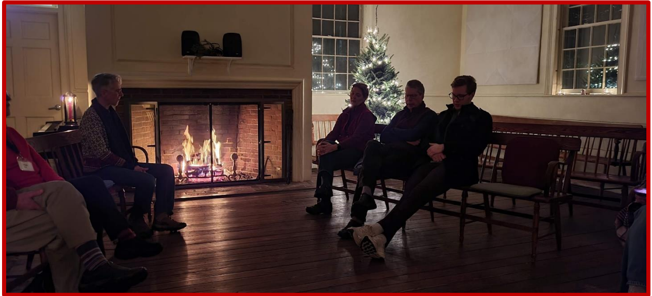
A small group gathered on Christmas Eve to enjoy singing favorite carols amidst candlelight.