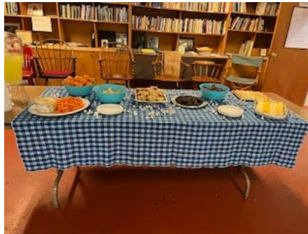
Snacks for visitors