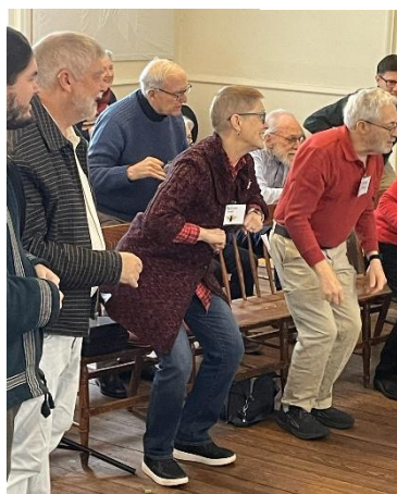
Three French Hens