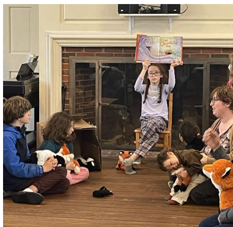
The Friendly Fox