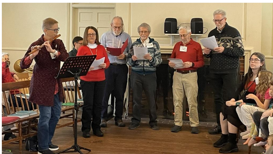
The Friendly Singers Perform

We celebrated the season together with music and a performance by the First Day School of "The Christmas Fox." There may have been goofy dancing to the Twelve Days of Christmas. All joyfully recorded to share with our Sister Meeting in Delicias, Cuba.